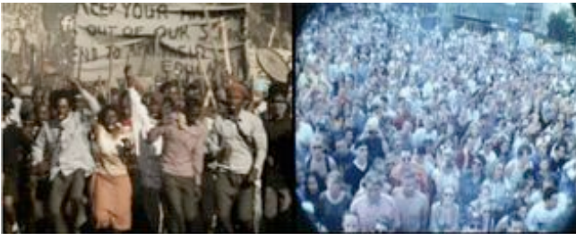
Dan Halter (Zimbabwe/South Africa). Untitled (Zimbabwean Queen of Rave) , 2005. Single-channel video with color and sound

The works are presented in 4 chapters, each containing 8 to 9 videos, and the exhibition unfolds simultaneously in multiple spaces, chapter-by-chapter, over the period of a year. In the first chapter of Project 35 , 9 emerging and established curators, who collectively have worked in countries as disparate as Egypt,