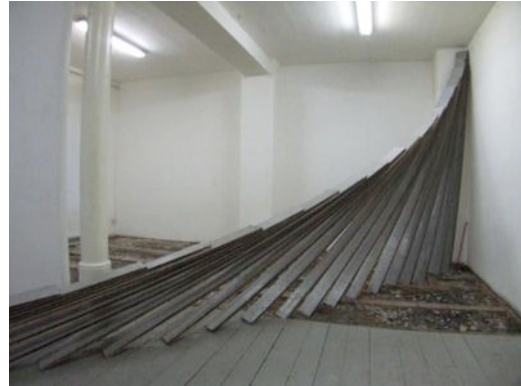
Yukihiro Taguchi (Japan/Germany). Selections from Moment , 2007-08. Single-channel video excerpts

for ICI, with an eclectic compilation of works that reveal the global reach that video has achieved as a contemporary art medium today.