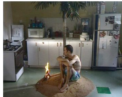
Guy Ben-Ner (Israel) Berkeley's Island , 1999. Single-channel video with color and sound.

The collective desire for communication – for sharing perspectives – is evident in Project 35 – through the subjects dealt with by each artist. These range from reinterpretations of philosophical propositions to uprisings and protests in South Africa, propaganda news broadcasts in China, and emerging youth culture in Ho Chi Minh City. The works also reveal the diversity of approaches artists are now taking to the medium, using various animation techniques, as well as borrowing from the language of cinema, performance, and even YouTube to produce work that weaves between documentary and fiction.